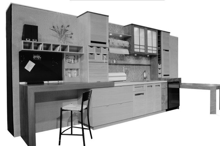
Pictured above: Neil Kelly Cabinet's Mid-Century Modern Collection —Ten door styles are now available: Post Modern, Cubist, Split Level, Biscayne Bay, Barcelona, Butterfly Roof, Golden Gate, Route 66 (Vertical and Horizontal), Flat Frame and Dominoes.