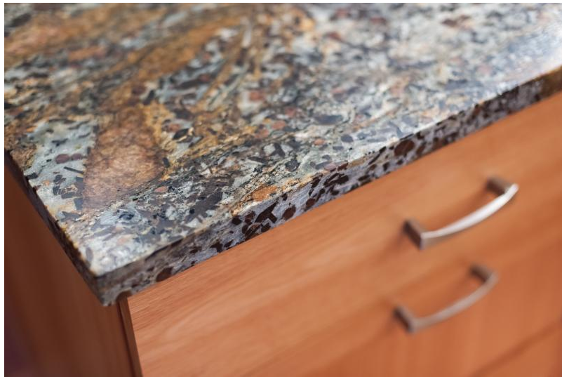
Satin or Brushed Finish

A word about Granite and Natural Stone Countertops: Natural stones provide the most unique of countertop materials as each piece boasts its own pattern and color that won't be found in man-made materials. Most granite is hard and durable, but not indestructible as they can chip, scratch and stain. Penetrating sealers help in preserving the counter when first installed, although the user will still want to exert care with oils and acids (think oil and vinegar). Oils can stain deeply and acids can etch the surface.