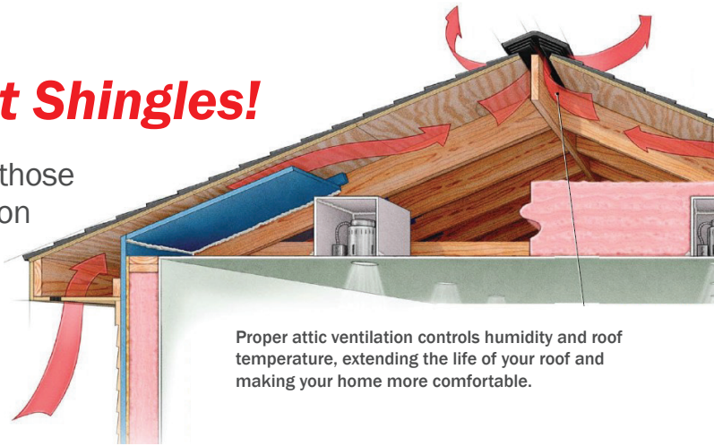
Proper attic ventilation controls humidity and roof temperature, extending the life of your roof and making your home more comfortable.

The most important components of your roof are those you can't see. Roof deck protection, attic ventilation and leak barriers are critical to roof performance and longevity. GAF's Lifetime Roofing System, installed by Neil Kelly, provides maximum protection for your home.